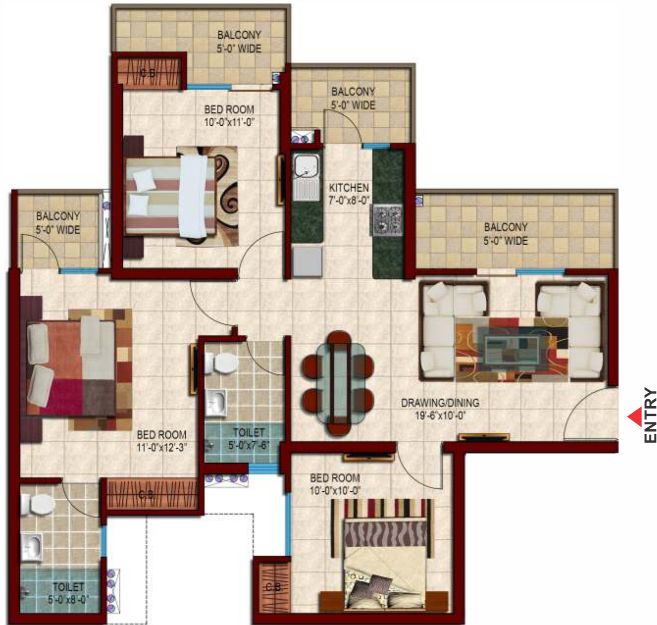
TYPE E ■ 3 BEDROOM + 2 TOILET

Carpet Area 69.88 Sq.mt. / 752.20 Sq.ft. Builtup Area 91.78 Sq.mt. / 987.90 Sq.ft. Super Area 117.99 Sq.mt. / 1270.00 Sq.ft.