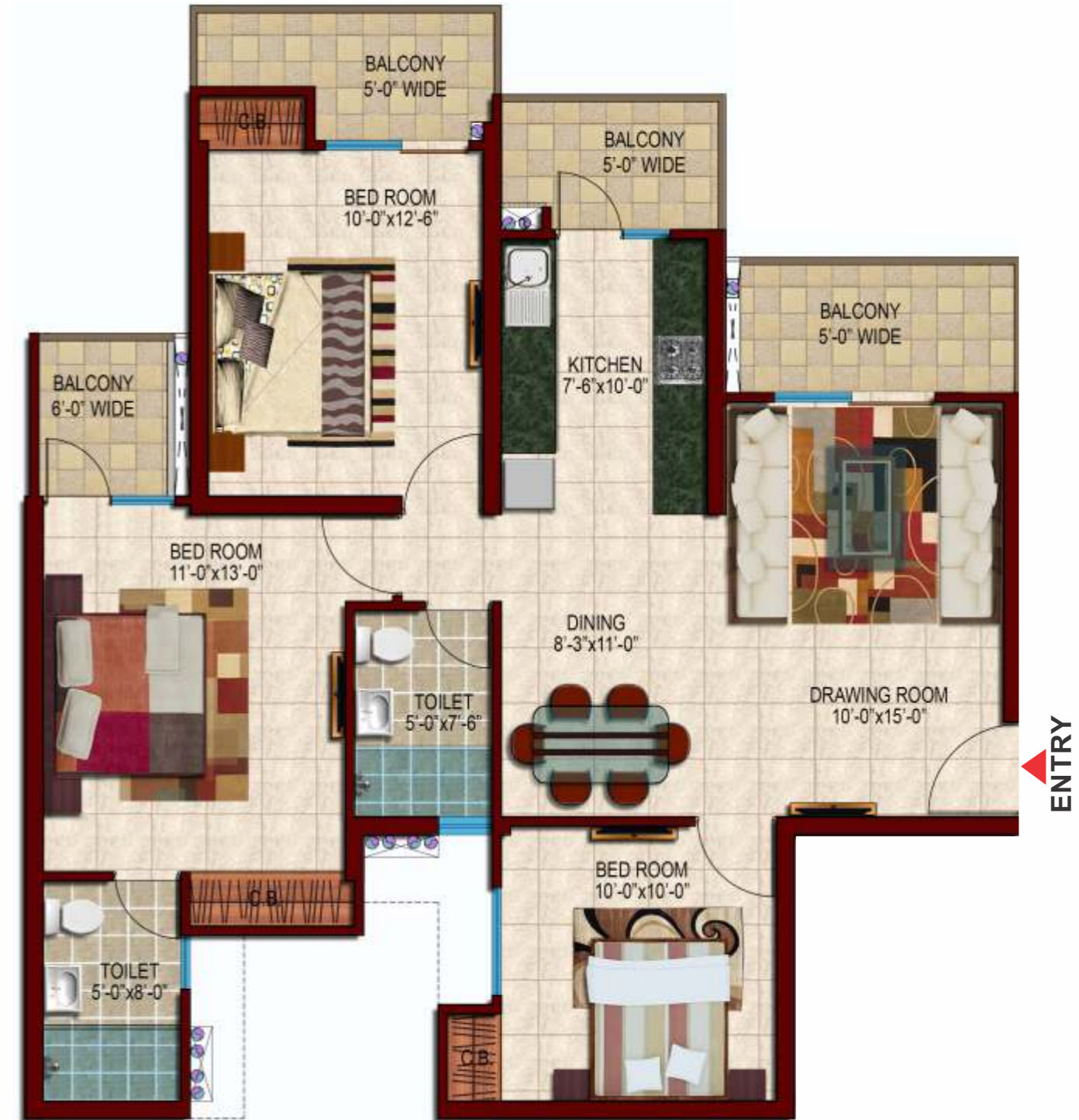
TYPE F ■ 3 BEDROOM + 2 TOILET

Carpet Area 78.26 Sq.mt. / 842.37 Sq.ft. Builtup Area 100.75 Sq.mt. / 1084.43 Sq.ft. Super Area 128.67 Sq.mt. / 1385.00 Sq.ft.